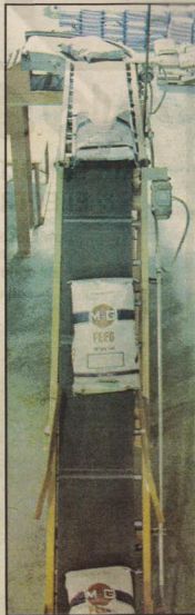
The conveyor belt.