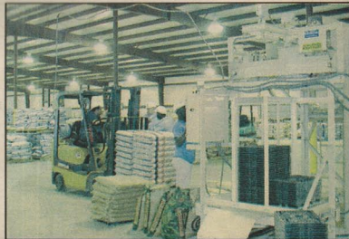
The forklift takes the sacks from the stacking machine.