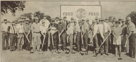
Ground was broken on the new M-G plant in July 2000